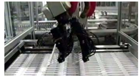
Robotic Loading of Thermoformed Blisters

Dosed tablets and handles, components for the drug delivery device, enter the dual-lane assembly process through separate feeders. Two FANUC LR Mate 200iB robots, with ESS-designed end-of-arm-tooling, insert the labeled handles into the tablets. Two more robots collate the devices and transfer them to a thermoformer infeed conveyor. A fifth robot loads 30 completed assemblies per pick to thermoformed blisters.