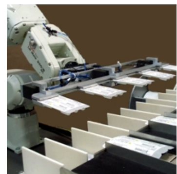
Collating and Loading Blister Packs into a Cartoner Infeed Bucket

The system met the high speed requirements for the assembly and packaging of the new drug delivery devices. The fully automated system doubled the production rate of the drug delivery devices to 320 pieces per minute. In addition, the number of required personnel was reduced from fifteen to five people, allowing the customer to reassign several personnel to other processes.