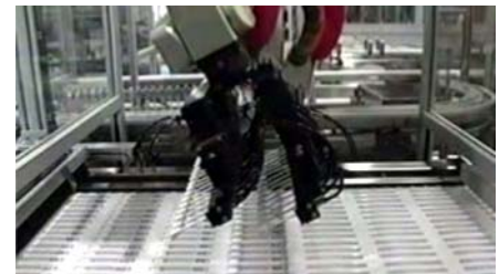
Robotic Loading of Thermoformed Blisters

Dosed tablets and handles, components for the drug delivery device, enter the dual-lane assembly process through separate feeders. Two FANUC LR Mate 200iB robots, with ESS-designed end-of-arm-tooling, insert the labeled handles into the tablets. Two more robots collate the devices and transfer them to a thermoformer infeed conveyor. A fifth robot loads 30 completed assemblies per pick to thermoformed blisters.