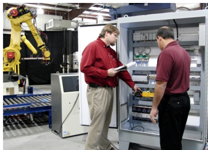
ESS Technologies, Inc. is an Authorized FANUC System Integrator and Strategic Partner for Secondary Packaging and Palletizing Solutions

Moving from trend to tradition, more and more packagers are adding robotic systems to their packaging process. Experienced robotics system integrators can help packagers understand the impact of a well-performed audit of the current process and the advantages of cost savings and productivity that robotics automation has to offer packaging processes. By partnering with an experienced systems integrator, packagers can increase their line productivity and reduce scrap and rework by automating both primary and secondary packaging processes.