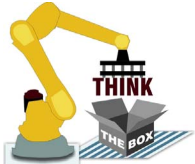
Innovative Packaging Solutions

By ESS Technologies, Inc. Blacksburg, VA • www.esstechnologies.com