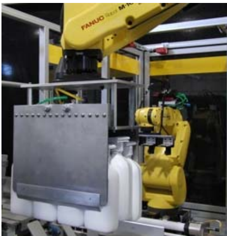
FANUC M-16iB Case Packing Pharmaceutical Bottles with Topserts

Cost calculations also must include a full understanding of operational cost savings over time. Too often, the purchasing decision is based solely on the initial capital purchase, but a system designed after a thorough audit has greater value in the short term and the long term due to reduced changeover time, repeatable changeovers and reduced change parts. Downtime for changeovers