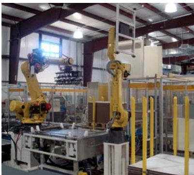
Automatic Top Cap Forming System and Robotic Pallet Cell for Creating Retail-ready Display Pallets

By assessing the current process, packagers can identify the areas that will benefit from robotics automation. This includes quantifying current staffing requirements for the production line. Robots do not replace valuable human resources, but integrating robotics will allow those resources to be placed where robots are not usable. On the other hand, robots do not suffer from repetitive motion injuries, reducing costs and downtime due missed work, making these types of processes ideal for automation. The assessment should also be used to pinpoint weak areas in the line's efficiency, especially in the areas of material handling. Finally, the audit should include information about the line's overall downtime and the reasons for that downtime, as well as the current scrap and rework rates.