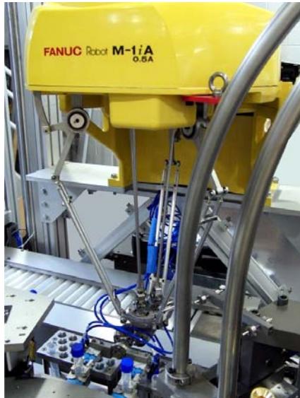
FANUC M-1iA Robot Unloading Vials from a Monoblock Filler/Capper and Placing Them on a Labeler Infeed Conveyor

By ESS Technologies, Inc. Blacksburg, VA • www.esstechnologies.com