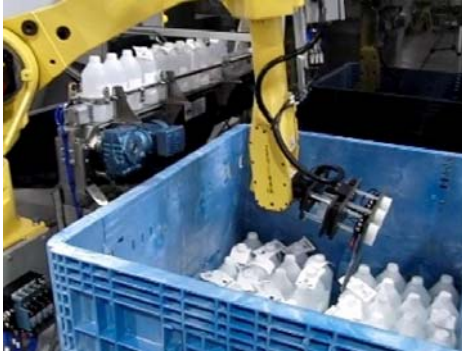
FANUC M-16iB Robot With Multi-purpose EOAT Nudges Pharmaceutical Bottles Into Place After Loading Them In the Crate

By ESS Technologies, Inc. Blacksburg, VA • www.esstechnologies.com