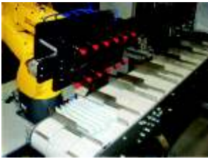
Loading an SC 60 Cartoner