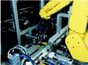
Pick & Place Plugs in Bottles