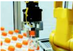
Sampling Laboratory Bottle Weights