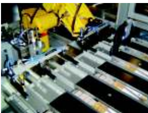
Orienting and Collating Blisters